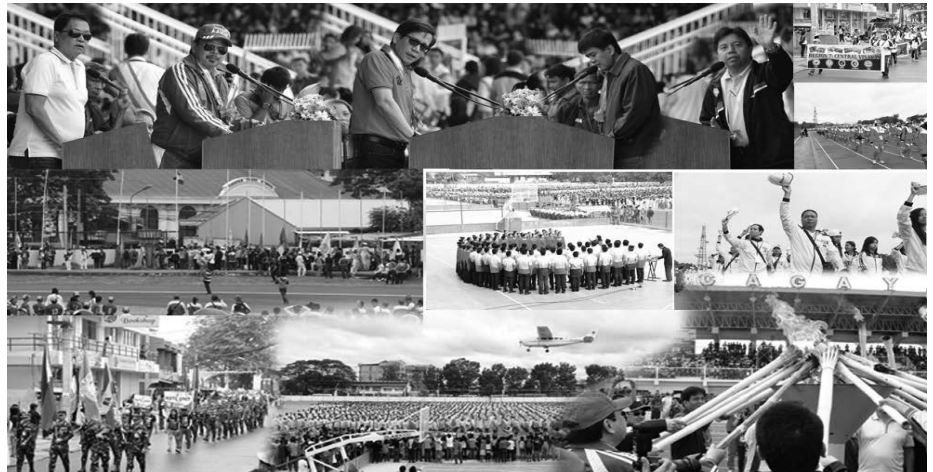
Local and national media picked up these historic moments that placed Tuguegarao City in the online and offline space.

Rep. Roman Romulo, chair of the house committee on higher and technical education, graced the opening ceremony of the sportsfest with around 5,000 athletes and officials who will vie for top honors led by the perennial champion, National Capital Region, and who the congressman described as the future sports