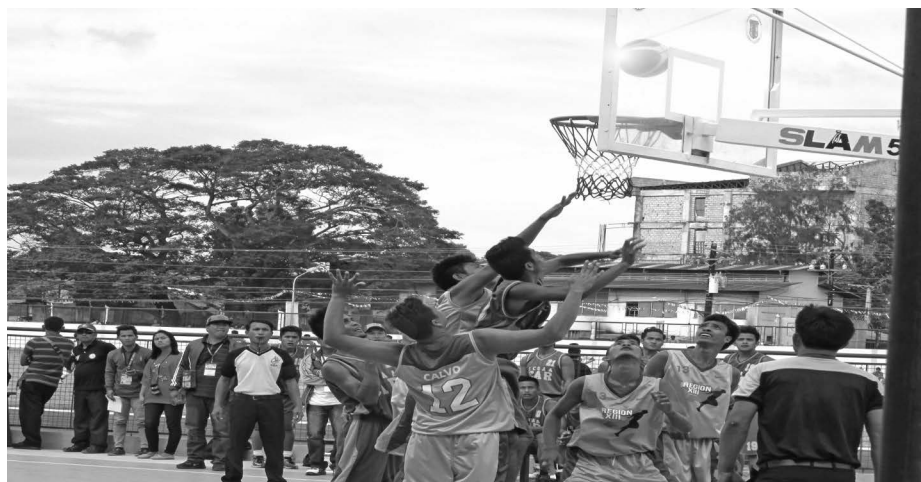
CAR players display their force that led them to stop the quest of CARAGA to win the game.